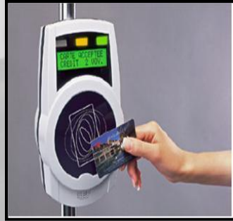
On Board Reader