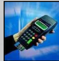
Conductor Handheld Device