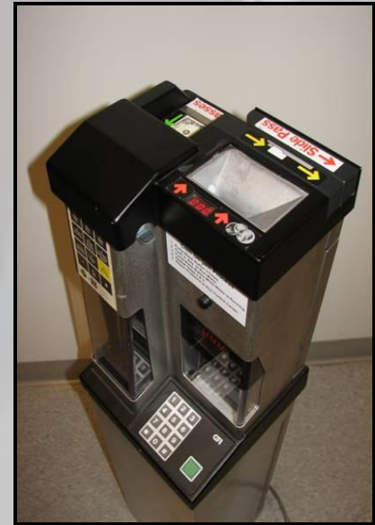
Upgraded Fare Box