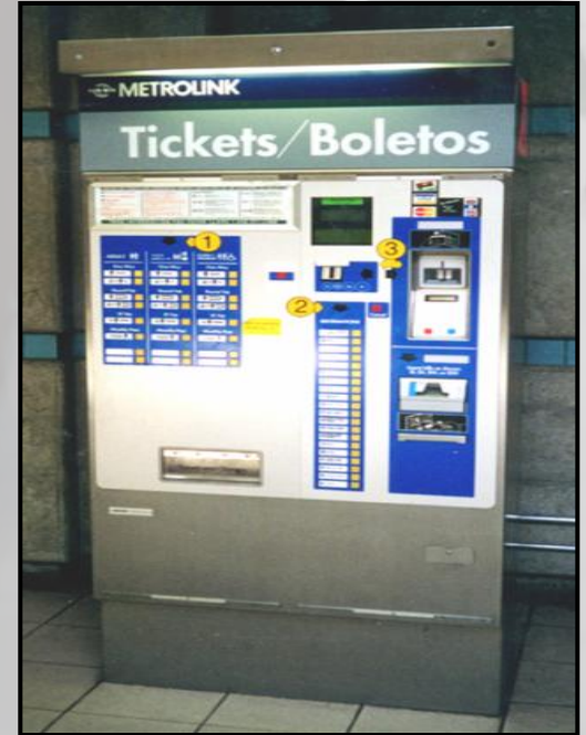
Fare Vending Machines